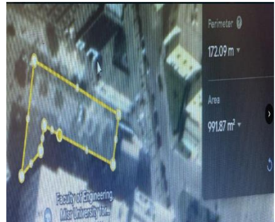
An aerial view showing the ratio of parking area to the total campus area