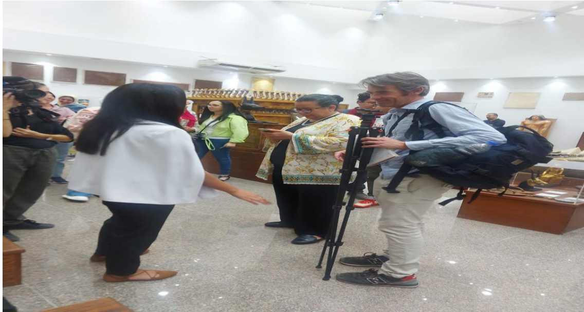
French channel shot a documentary clip at our university's museum.