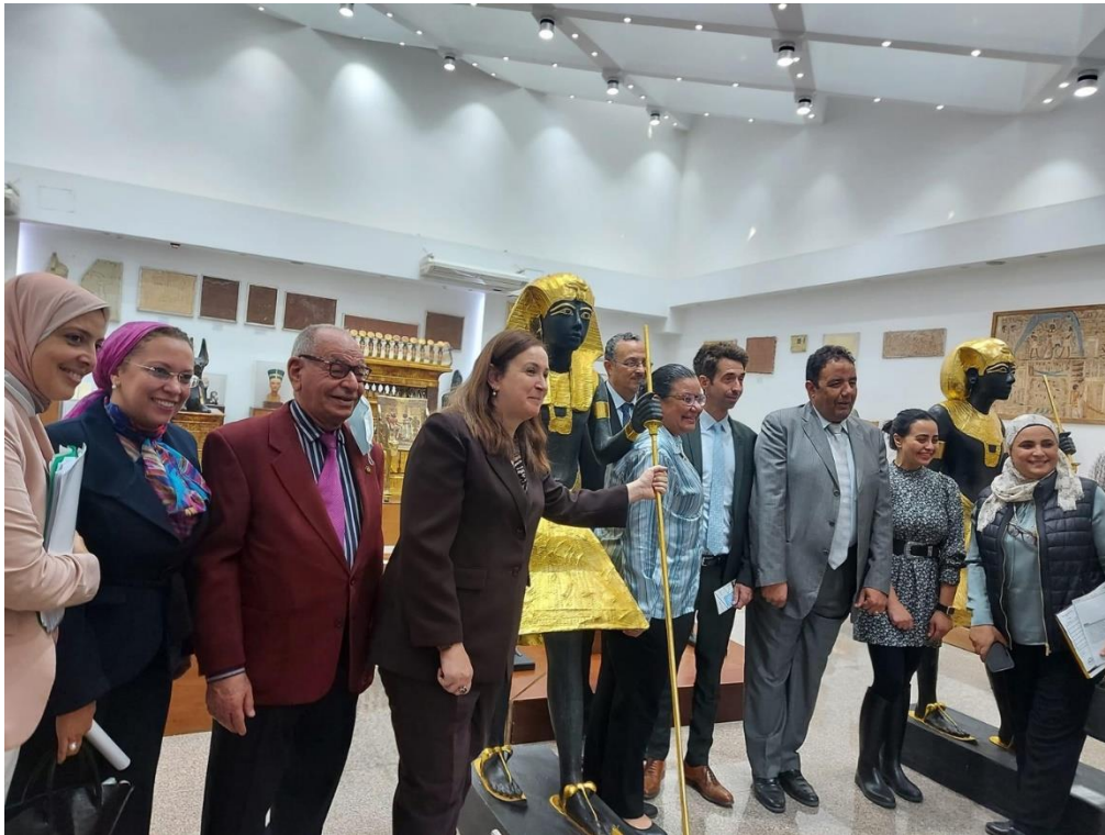
The visit of the representative of Bordeaux University in France.

MISR UNIVERSITY FOR SCIENCE & TECHNOLOGY