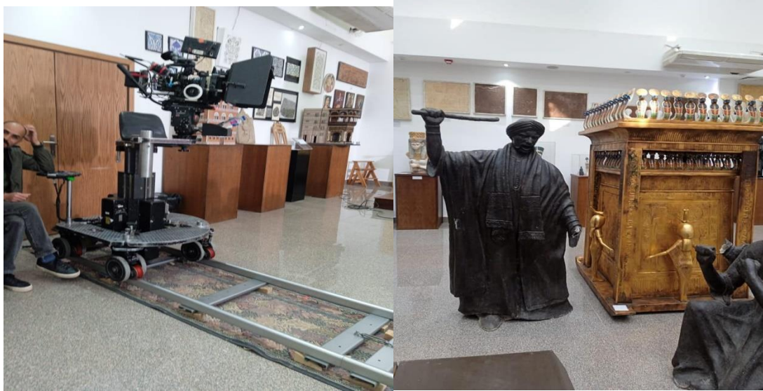
A TV series shot inside the museum. (El kbeer series by Ahmed Mekky)