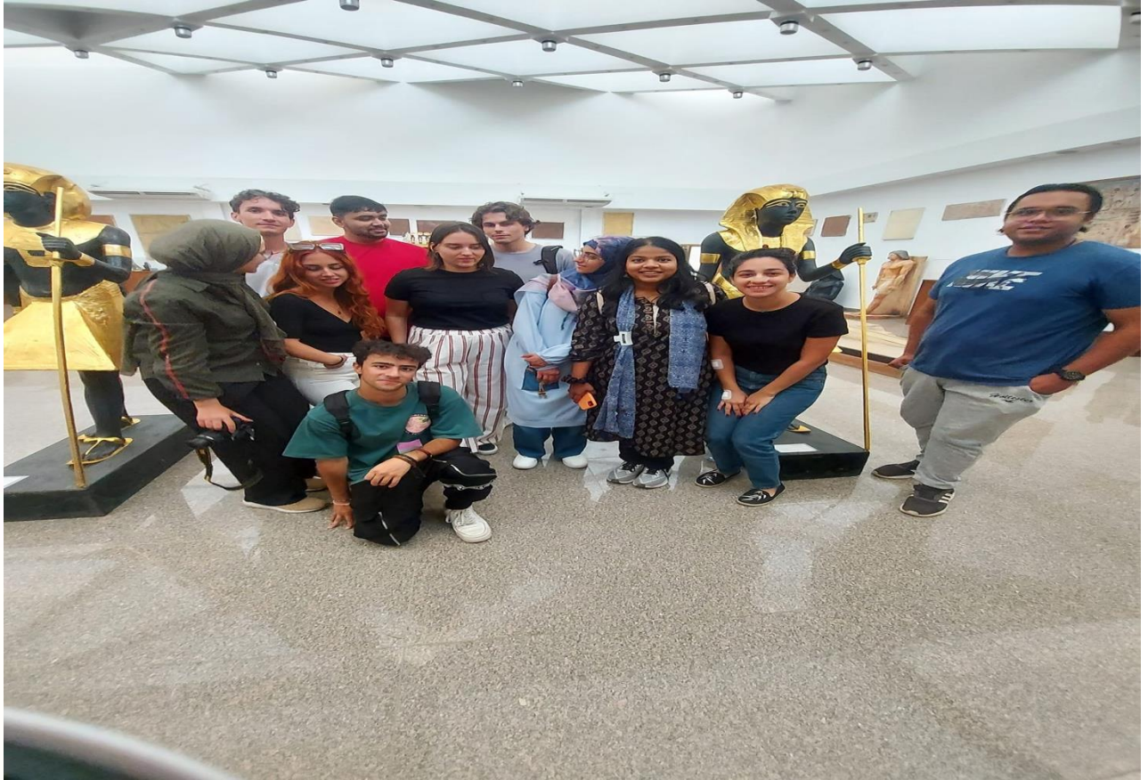
Exchange visit from Different Foreign Faculties.

MISR UNIVERSITY FOR SCIENCE & TECHNOLOGY