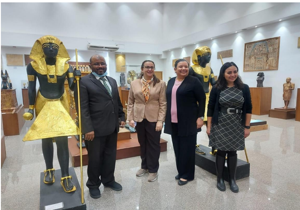
a visit from a UNESCO representative.